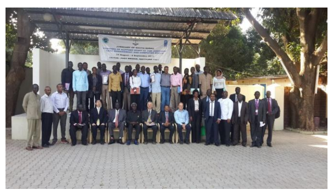
Graduation ceremony for the JoSS Computer Skills and Case Management Training in Juba, 4 September

The pilot phase of the case management system for the JoSS has recorded 1,223 cases at JoSS headquarters in Juba, with a completion rate of 23% (273 cases). In preparation of rolling out the case management system to judges in the states in the near immediate term and a transition to a digital case management system, a two-week training of 24 support staff (six female) on case management and computer skills led to an average increase in skills of 61%.