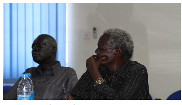
Justices discuss findings of the perception survey in Juba, 27 August

The findings of the Perception Survey on Truth, Justice, Reconciliation and Healing were presented in coordination with the South Sudan Law Society (SSLS) to 238 government (52 women), judiciary, civil society, academic and donor representatives on nine occasions in five states. Discussions resulted in state-level recommendations. Participants in CES recommended that close attention be paid to the different levels of conflict and that strategic planning and capacity assessments for effective implementation of the mechanisms need to be conducted. In Torit, participants recommended that the reconciliation process be implemented domestically, and that priority should